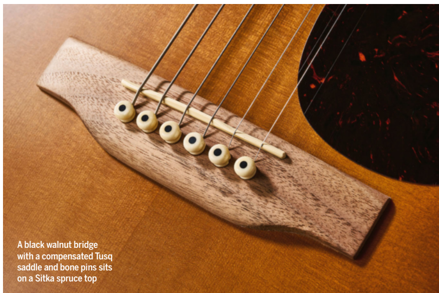
A black walnut bridge with a compensated Tusq saddle and bone pins sits on a Sitka spruce top

So, is Martin's new initiative a way to make maple-bodied instruments impersonate rosewood or mahogany? Well, maybe a little. But it's more about proving that alternative woods have their own characteristic soundprints, too; and many will deliver the goods, even if internet forums still wail to the contrary. After all, Gibson has successfully proved that maple is a contender on its J-200 and so why not?